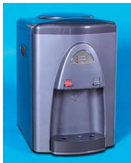
Executive Gray option