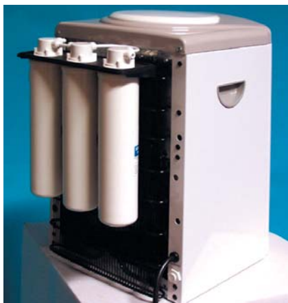
Filter Pack installs easily with 2 screws